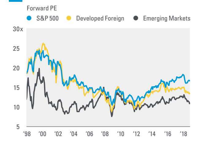
International Developed Valuations Are Being Distorted by Japan